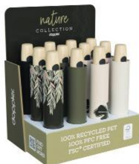
782156N for 12 mini umbrellas

The idea of sustainability is also reflected at the point of sale. A high-quality display in wood look with a natural looking surface texture offers enough space for all the umbrellas from the nature Collection. A floor display for the long umbrellas and a recycled cardboard table display for the pocket umbrellas are also available.