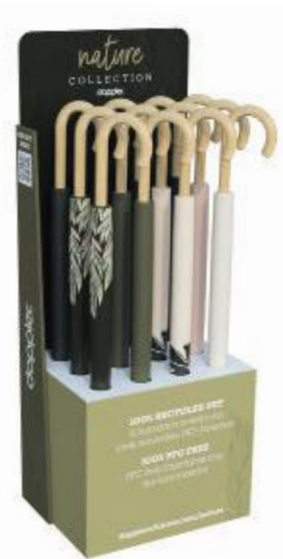
78999N for 12 long umbrellas

h BE THE CHANGE YOU WANT TO SEE IN THIS WORLD. h - Mahatma Gandhi